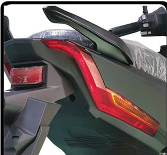
REAR COMB. LAMP