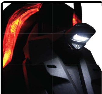
LICENSE PLATE LAMP