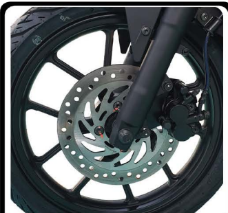
DOUBLE DISK BRAKE